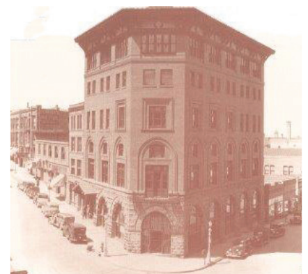
Historic Montana Club.