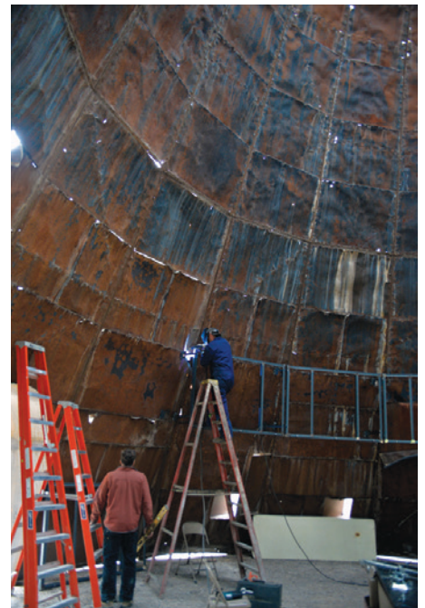
Kevin O'Dwyer welding on the inside of the gigantic teepee burner now on exhibit in Lincoln.

The MHS Research Center took a field trip to the burner in the "Blackfoot Pathways: Sculpture in the Wild" park and say it is well worth the trip. O'Dwyer researched the project at MHS and used the MHS Photograph Archives Collection. ★