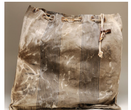
Congressional mail bag used by Jeannette Rankin.