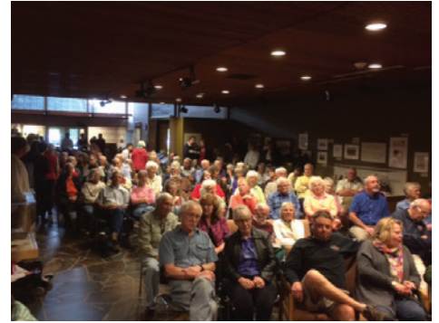
More than 200 people spilled out into the lobby of MHS to watch a program on closed circuit TV that was live in the small MHS auditorium.

in back. Now we build the garage in front and the deck in back for privacy. Despite these trends, it appears that people are hungry for social interaction, to learn together, to share common interests and develop relationships. The same question has to do with the internet’s impact on our sense of community. Has the internet destroyed libraries and historical societies? No. Libraries, like ours and many others around Montana, are no longer passive repositories of books and information, a quiet outpost of culture and decorum in a noisy world. The Montana Historical Society is an active, lively and responsive part of the community, and a change agent. The internet, it turns out, is one of the reasons people come to the MHS. They find basic information and want to dig deeper. They hit a wall with their own research and need to seek out experts. We help them make sense of what they have found on their own, and provide a sense of confidence in the information they discover. People trust MHS.