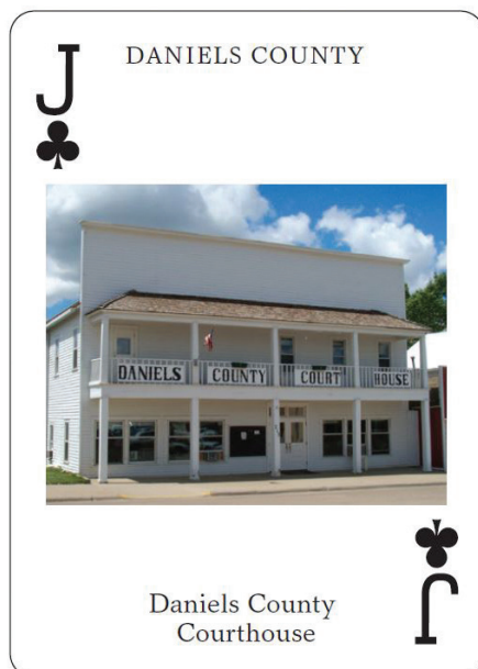
The Daniels County Courthouse is the jack of clubs in the SHPO playing cards.