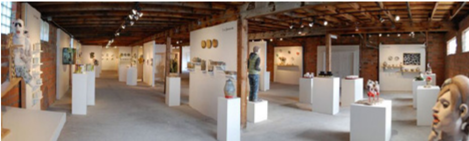
Archie Bray gallery

When you come to MHS, the State Capitol building and the Original Governor’s Mansion this summer, consider adding a stop at the Bray. 📍