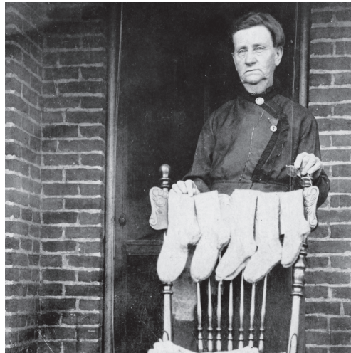
This Miles City woman knit 61 pairs of socks to be sent to soldiers at the front for the Red Cross drive in Montana. Women across the state did the same and rolled bandages and other material needed by soldiers at the front.