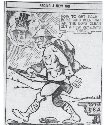
Troops returned to Montana with new ideas and attitudes.