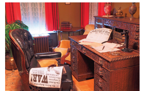
Gov. Stewart’s office in the Original Governor’s Mansion reflects the burdens WWI put on him and the young state of Montana.

The MHS Outreach and Interpretation program captured the real feel and tension of WWI and will take you on a tour that will remind you of a troubled time when Montana grew up. ☼