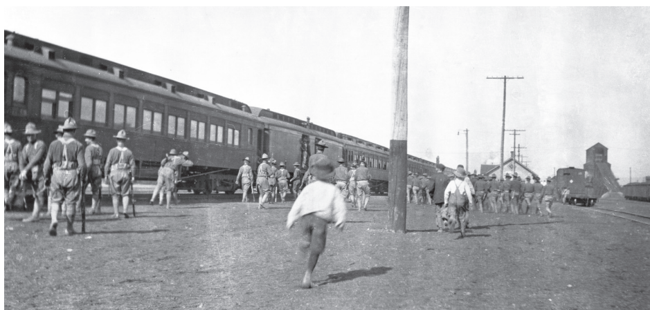
Troops returned to Montana with new ideas and attitudes.