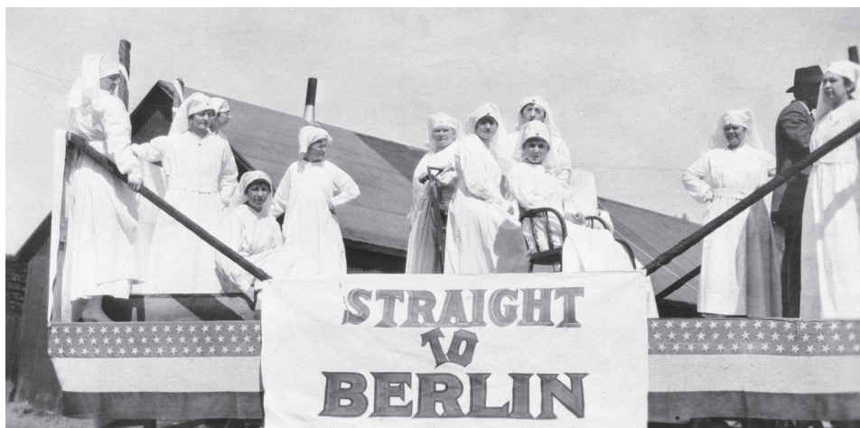
The Red Cross held hundreds of events to support the war including a parade in Hardin encouraging nurses to go overseas to care for soldiers.