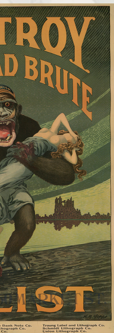
Image imagery to ans to enlist.

that you’ll want to attend. The “War to End All Wars” has lessons from yesterday that need to be understood today. ☼