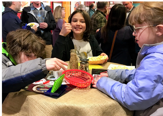
People of all ages enjoyed playing games and eating popcorn at the Good Beer Here: Montana's Brewing History exhibit opening.

The Society's newest temporary exhibit, "Good Beer Here: Montana's Brewing Industry," opened Thursday, February 27. Don't miss the opportunity to learn about the state's long brewing history!