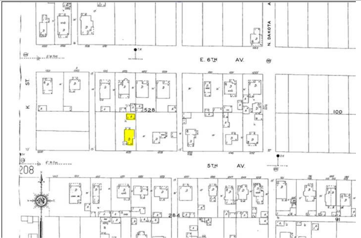
Sanborn Map, Helena, 1930, Sheet 209 1020 5 th Avenue highlighted