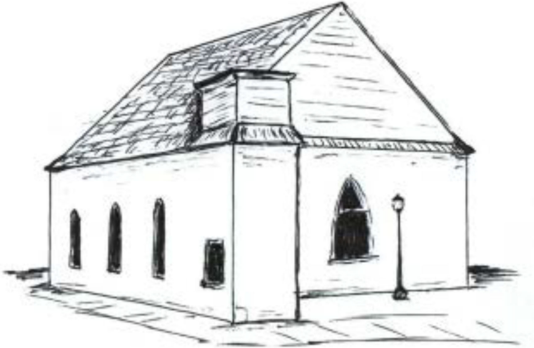
Drawing of Shaffer's Chapel A.M.E. Church, by Anthony Wood, 2015.

Silver Bow Co., Montana County and State