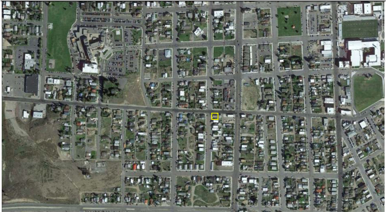
Aerial View of Location of Shaffer's Chapel A.M.E. Church.

Silver Bow Co., Montana County and State