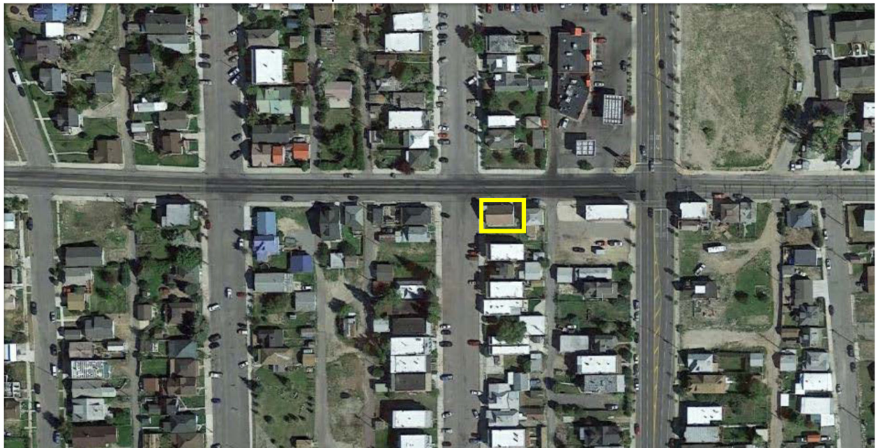
Close-up Aerial View of Location of Shaffer's Chapel A.M.E. Church.