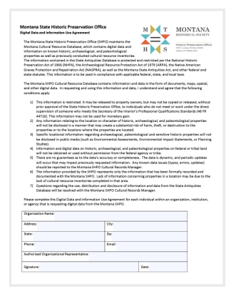
Data Use Agreement (DUA)

The File Search flat fee of $35 per section includes site records, inventory reports, and GIS data—but these items must be specifically requested at the time of the File Search. A la carte fees apply for Cultural Resource Data requests when these items are requested without a File Search: site records ($5/record), inventory reports ($1/MB), GIS shapefiles ($5/polygon).