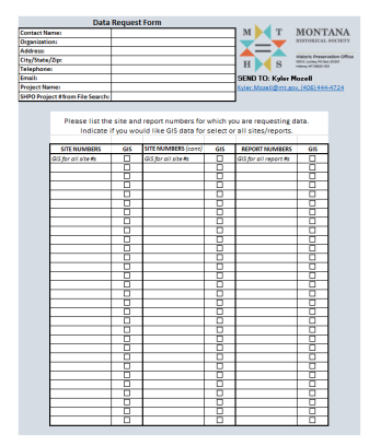
Data Request Form