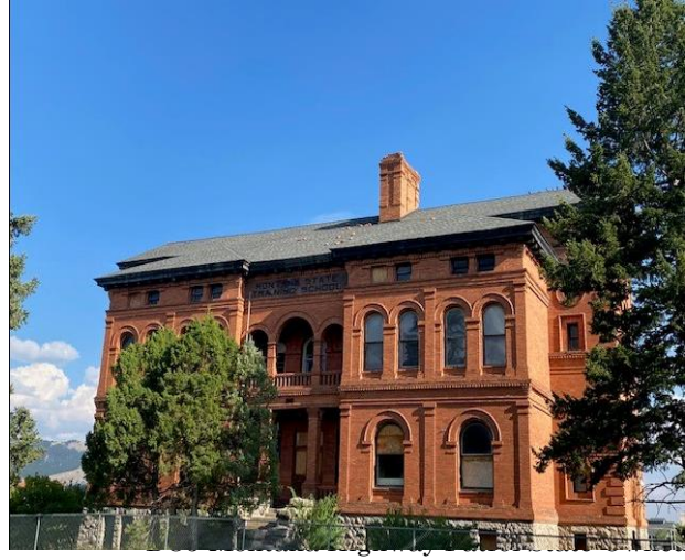
Heritage Properties Report Reporting Period 2020/2021 -4

This is the first reporting period since DOJ has taken responsibility for Building #100. Therefore, DOJ has no prior records on this property. Prior heritage property stewardship reports were filed by the Department of Health and Human Services.