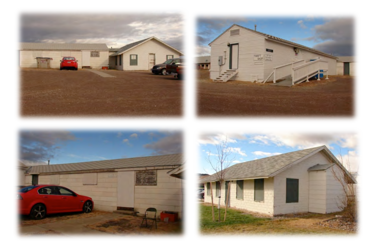
Figure 3. Three of the four buildings (with boarded windows) that make up the Thrift Shop complex.

The Thrift Shop complex has been leased to a non-profit since the 1970s (National Guard Thrift Shop) and is not necessarily managed on a daily basis by the DMA. However, the DMA has recently taken steps to aid the non-profit in upgrading the buildings, and the non-profit recently replaced rotting window frames with historically accurate windows on one side of one of the four buildings. The DMA aided the non-profit by initiating a study to determine a historically accurate style of window replacement and consulted with SHPO in order to receive project concurrence. It is the DMA's intention to continue working with the non-profit toward upgrading the Thrift Shop complex in the future.