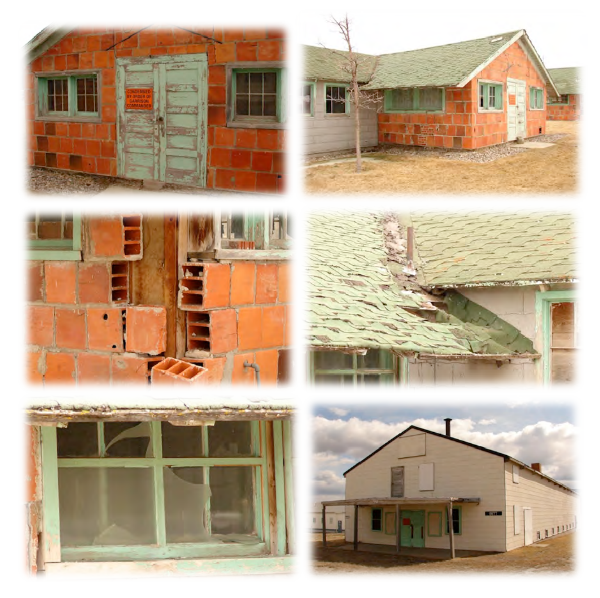
Figure 4. Condemned buildings-Building numbers T-102 and T-103 (clay tile Company Kitchens) located within the historic district and the independently eligible Theatre located outside of the district.