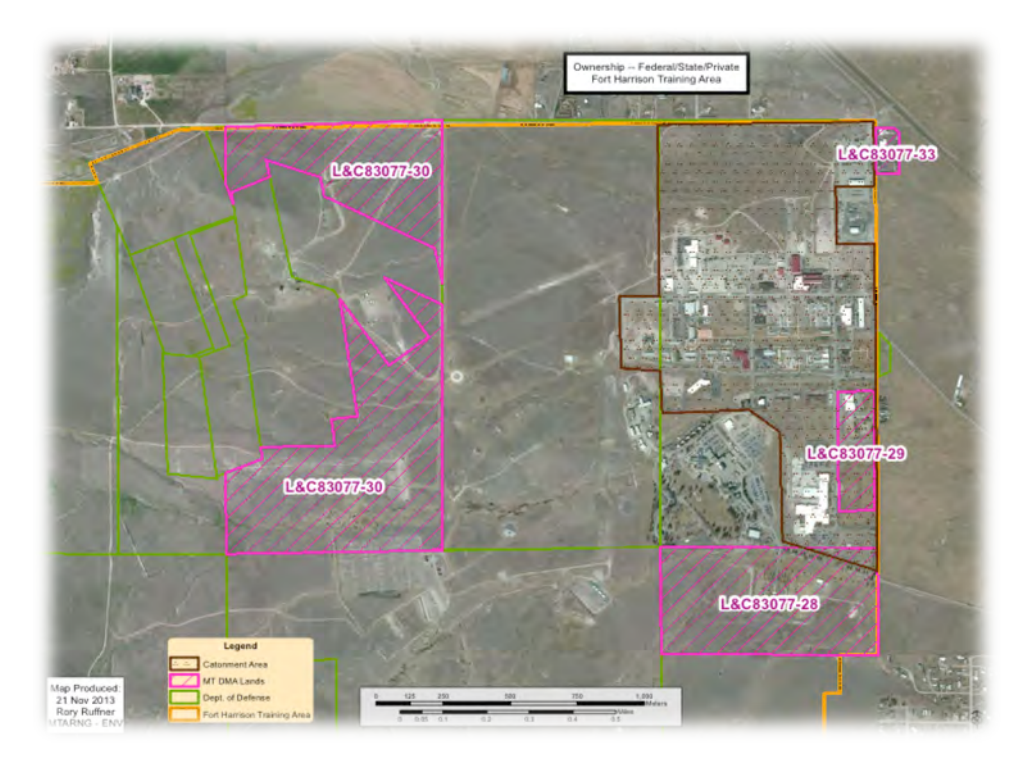
Figure 1. Land ownership at Fort Harrison (state lands are outlined in pink). Parcel number L&C83077-29 inside of the cantonment area is the location of the Womack Armory (Ruffner, 2013).

As part of this reporting session's identification efforts, the author of this report conducted an in-depth existing data review of cultural investigation reports, site forms and property ownership surveys to make certain that no previously identified heritage properties exist on state lands owned by the DMA. Additionally, this effort involved reviewing the data to ensure that proper methodologies were utilized for investigating state lands and that all resources were evaluated for their National Register eligibility. The author verified that a majority of all of the DMA's state owned lands have been surveyed; that cultural resources have been properly documented and evaluated; and that no heritage properties exist on those parcels. In regard to the National Guard Readiness Centers, the author has verified that all but one of the state's armories that has reached 50 years of age has been evaluated using National Register criteria, and none of the armories that have been documented meet the National Register criteria as independent elements. The original armory survey was conducted nearly four years ago, but the survey was updated and filed with SHPO during this reporting period.