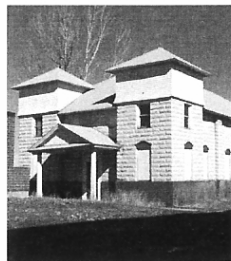
Preserving Montana's Heritage for the Next Generation