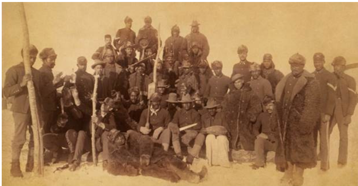
Figure 3: Unknown, "Buffalo soldiers of the 25th Infantry, some wearing buffalo robes, Ft. Keogh, Montana," 1890, Library of Congress Prints and Photographs Division Washington, D.C., Digital I.D. #: cph 3g06161 http://hdl.loc.gov/loc.pnp/cph.3g06161 .