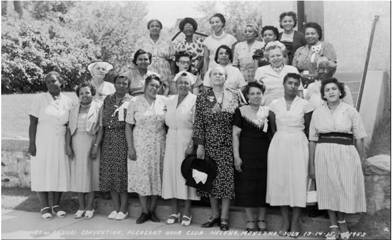
Figure 16: Catalog # 96-25.13, L.H. Jorud, photographer, "32nd Annual Convention, Pleasant Hour Club, [Montana State Federation of Negro Women's Clubs], Helena MT, July 13-15, 1953. [photo taken July 14th], Montana Historical Society Research Center Photograph Archives, Helena, MT, Catalog # 96-25.13