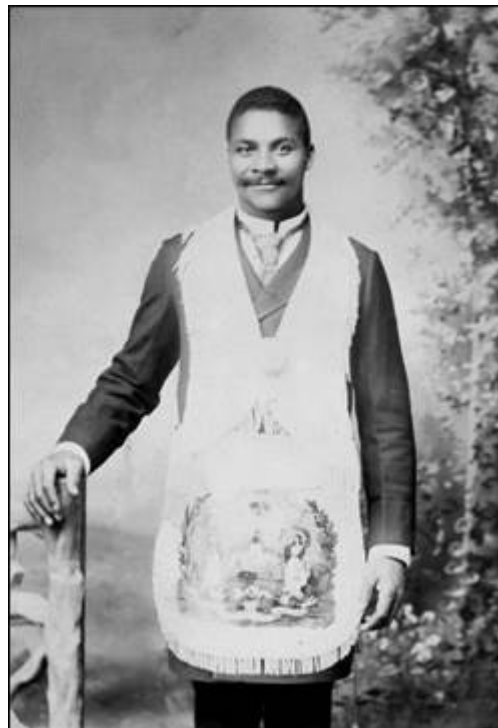
Figure 10: J.P. Ball and Son, "Studio portrait of an unidentified African-American man, wearing a fraternal apron, Helena, Montana, ca. 1890," Montana Historical Society Research Center Photograph Archives, Helena, MT, Catalog # 957-606. His apron design indicates he was a member of the Grand United Order of Odd Fellows.