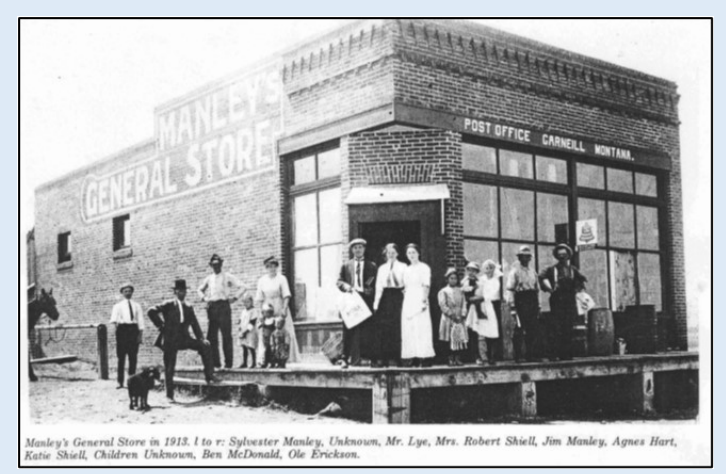
Manley's General Store, Fergus County