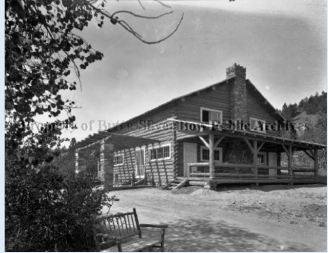
Castle Rock Lodge, Silver Bow County

September 12, 2024 Butte Public Library, Butte Hosted by the Montana State Historic Preservation Office of the Montana Historical Society