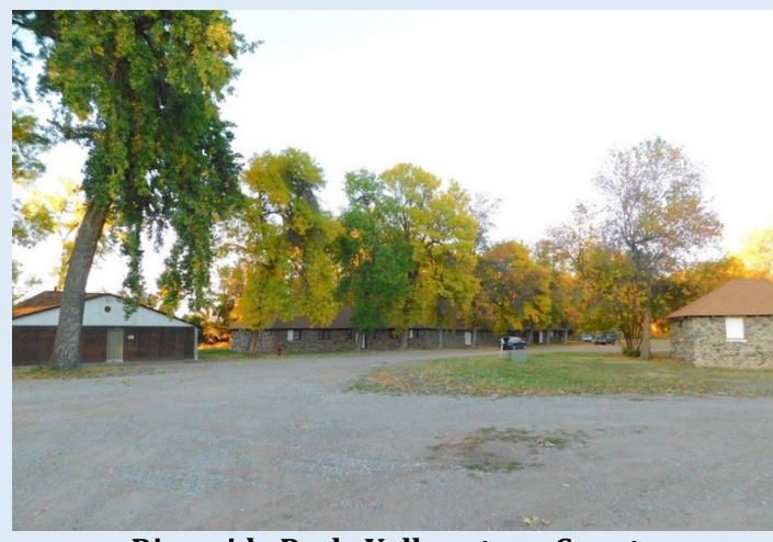
Riverside Park, Yellowstone County