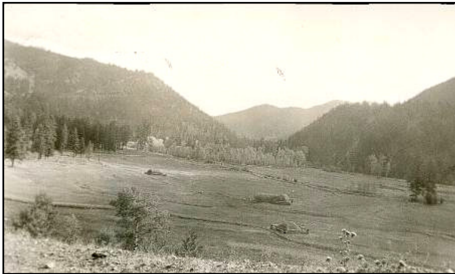
Overview of the hay fields, looking south from the Rock Creek Road where it crosses the Big Hogback .