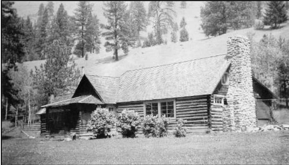
The homestead dwelling circa 1944. Note the row of lilacs adjacent to the building.

Morgan-Case Homestead, Granite County, Montana