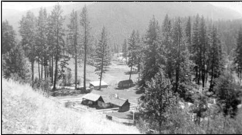
Looking southwest over the developed area from the slope of the Big Hogback. Note the yard fences.