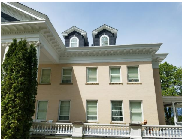
Picture 13: Daly Mansion high roof fascia repaired & painted. painted.