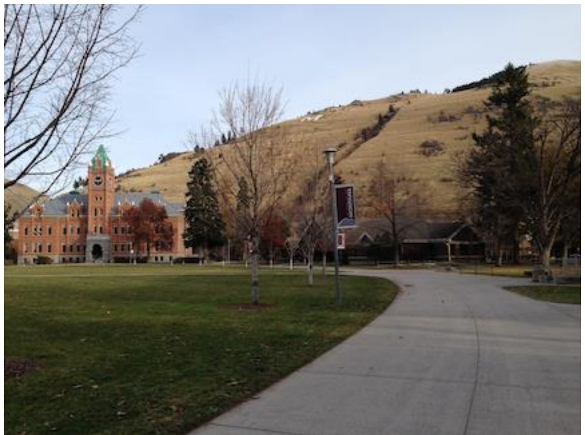
The Oval and Main Hall

The following buildings retain "excellent" integrity since the last reporting period: