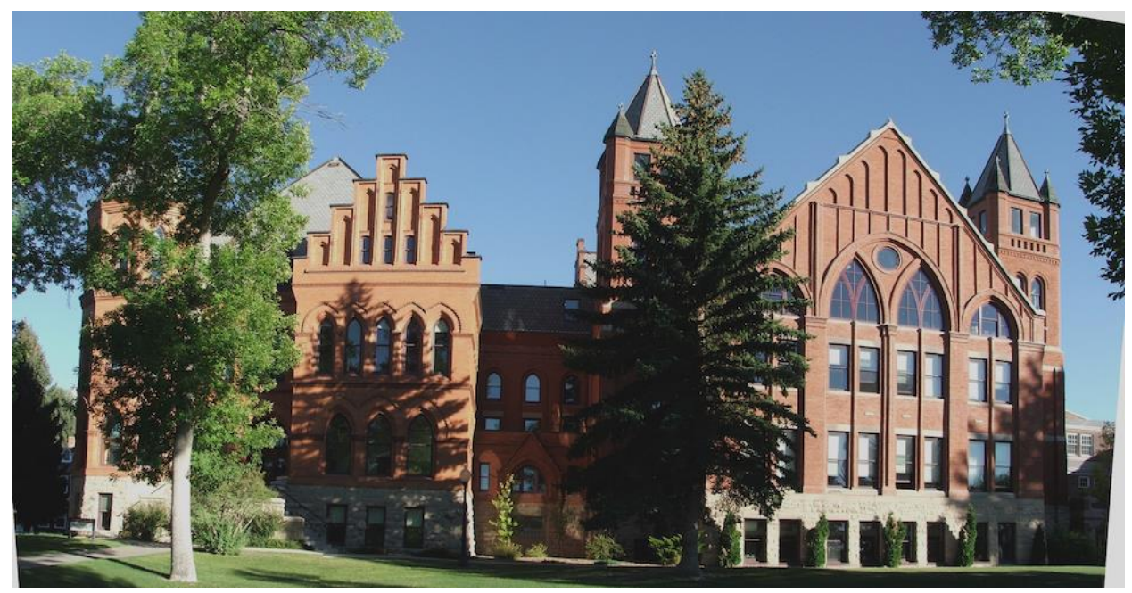
UMW Main Hall