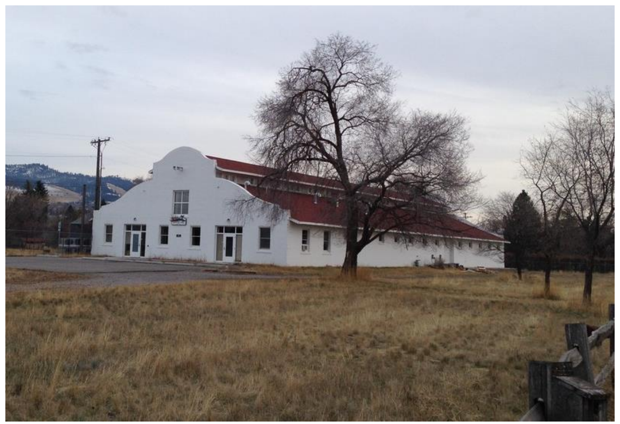
Quartermaster Stables Field Research Station