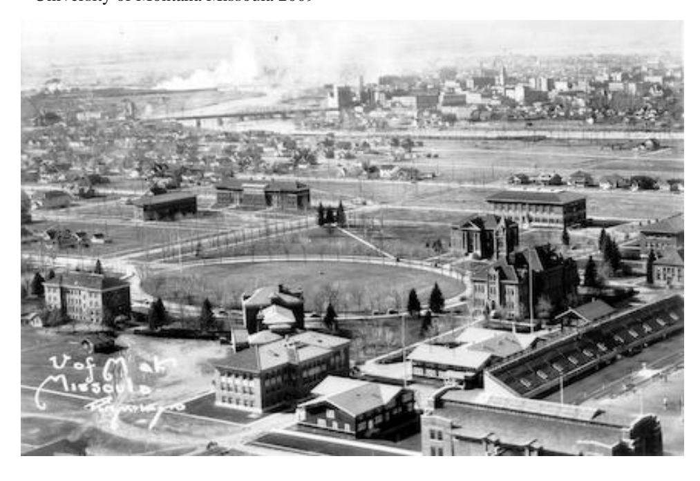
University of Montana Missoula 1940