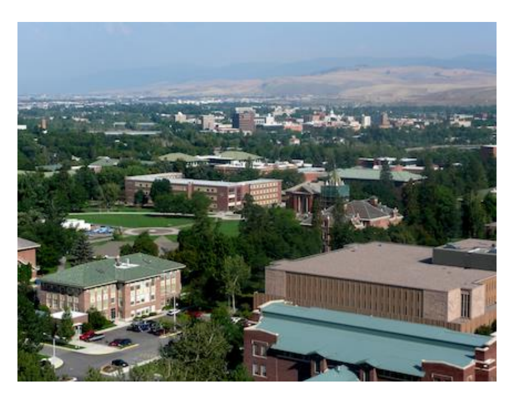
University of Montana Missoula 2009