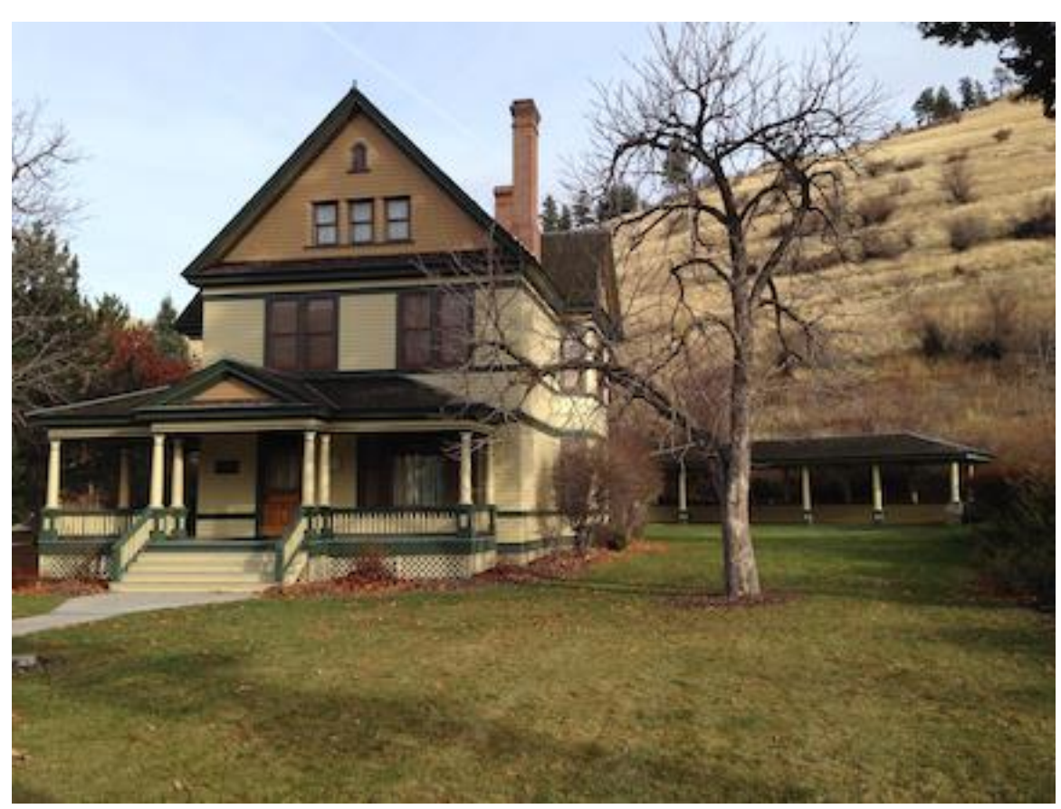
Clarence R.Prescott House