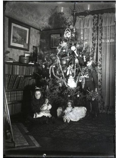
Girl hanging ornament on Christmas Tree

Perspectives on Women's Archives: The eighteen essays in this volume discuss women's archives and their efforts to document "the origins of a women-centered history, the urgent need to locate records that highlight the diverse experiences of women, and the effort to document women's experiences.... [and] expose the need for renewed collaboration between archivists and historians, the challenges related to the accessibility of women's collections, and the development of community archives." It is part of the One Book-One Profession series and is available as an epub or PDF. See https://