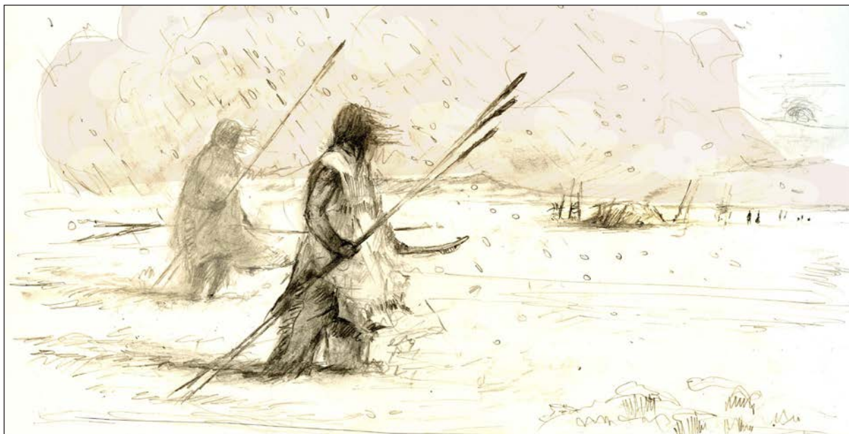
We don't have any pictures of ice age Montana. Here is what one artist thinks it might have looked like.

These first peoples traveled in small groups. They knew where to find the things they needed. One place might have a special kind of stone, perfect for making hammers. Another place might have flint for making knives. They traveled to these places to gather the resources (useful things) they needed. They carried everything they owned with them. Do you think they owned a lot of things?