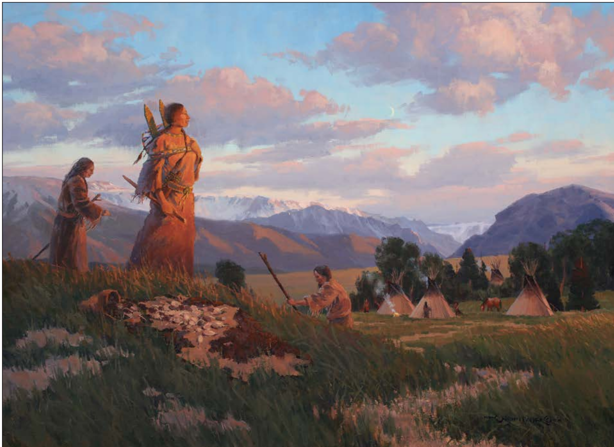
Early peoples relied on plants for food and medicine. These women are digging prairie turnips to help feed their families.

About 8,000 years ago, the place now known as Montana began to grow warmer and drier. Many of the giant, ancient animals became extinct (gone). Smaller animals, like deer, antelope, and rabbits, filled the plains (flat land). More plants appeared. The people learned how and where plants grew and how to use them to make food, medicines, rope, shelters, and baskets.