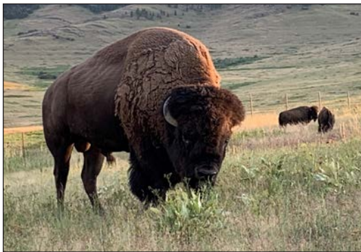
At one time, Montana was home to many more bison than people. Today, you can only see them at a few places like the Bison Range near Moiese.

here. Indians and European-American fur trappers and traders shared many survival techniques. Many trappers established very close relationships with Indian tribes, and many married Indian women. A new culture of people was created through intermarriages. They called (and still call) themselves the Métis, a French word meaning “mixed blood.”