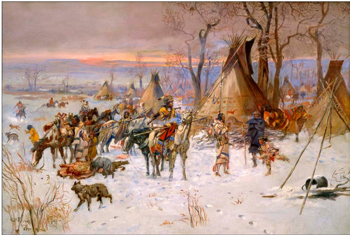
This painting, by Montana’s “Cowboy Artist” Charlie Russell, imagines successful hunters returning to camp on a cold winter day.

People have lived in the place we now know as Montana for at least 12,000 years. The pull factors that brought them here