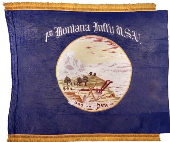
This banner, carried during the Spanish-American War, became the model for the Montana state flag.

The twentieth century would bring even more changes and even more people to Montana.