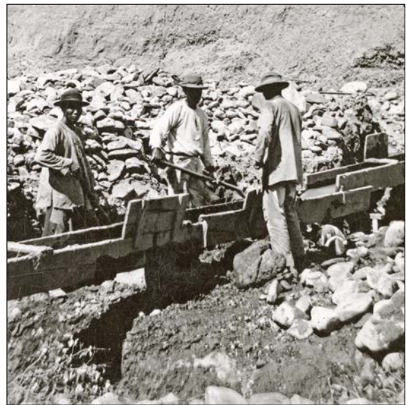
Working together in 1871, these Chinese miners used a sluice box to help them separate gold from the dirt and rocks.

In 1862, prospectors (people looking for gold) found gold on Grasshopper Creek in southwest Montana. It wasn't the first gold strike (discovery) in the region, but it was the biggest. Within weeks, four hundred people flocked to the creek, building the town of Bannack. The next year, prospectors found more gold in Alder Gulch. Thousands of people soon arrived to build the town of Virginia City. In 1864, there was another rich strike. This one created the town of Helena. Between 1862 and 1865, Montana mines produced more than $90 million worth of gold.