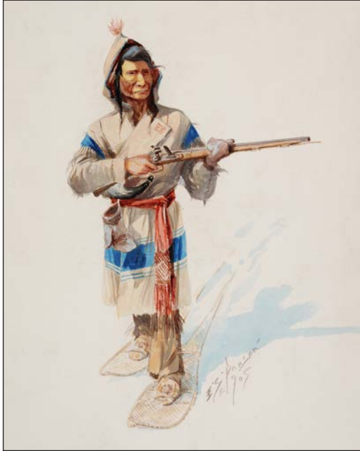
Métis men often wore capotes —coats made from thick, wool, Hudson’s Bay blankets—tied with a colorful handwoven sash. They wore colorful leggings and their moccasins often were beaded with elegant designs.