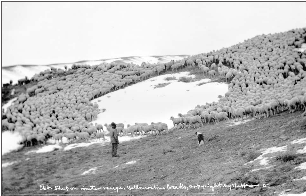
Shepherders relied on their dogs to help them take care of their flocks.

Montana's rich grasslands made the state perfect for raising cattle and sheep. Mining towns created a local market for beef in the 1860s. In 1883, the Northern Pacific Railroad completed its transcontinental (all the way across the continent) line. After that, ranchers could easily ship their cattle to the East Coast, where people were hungry for beef.