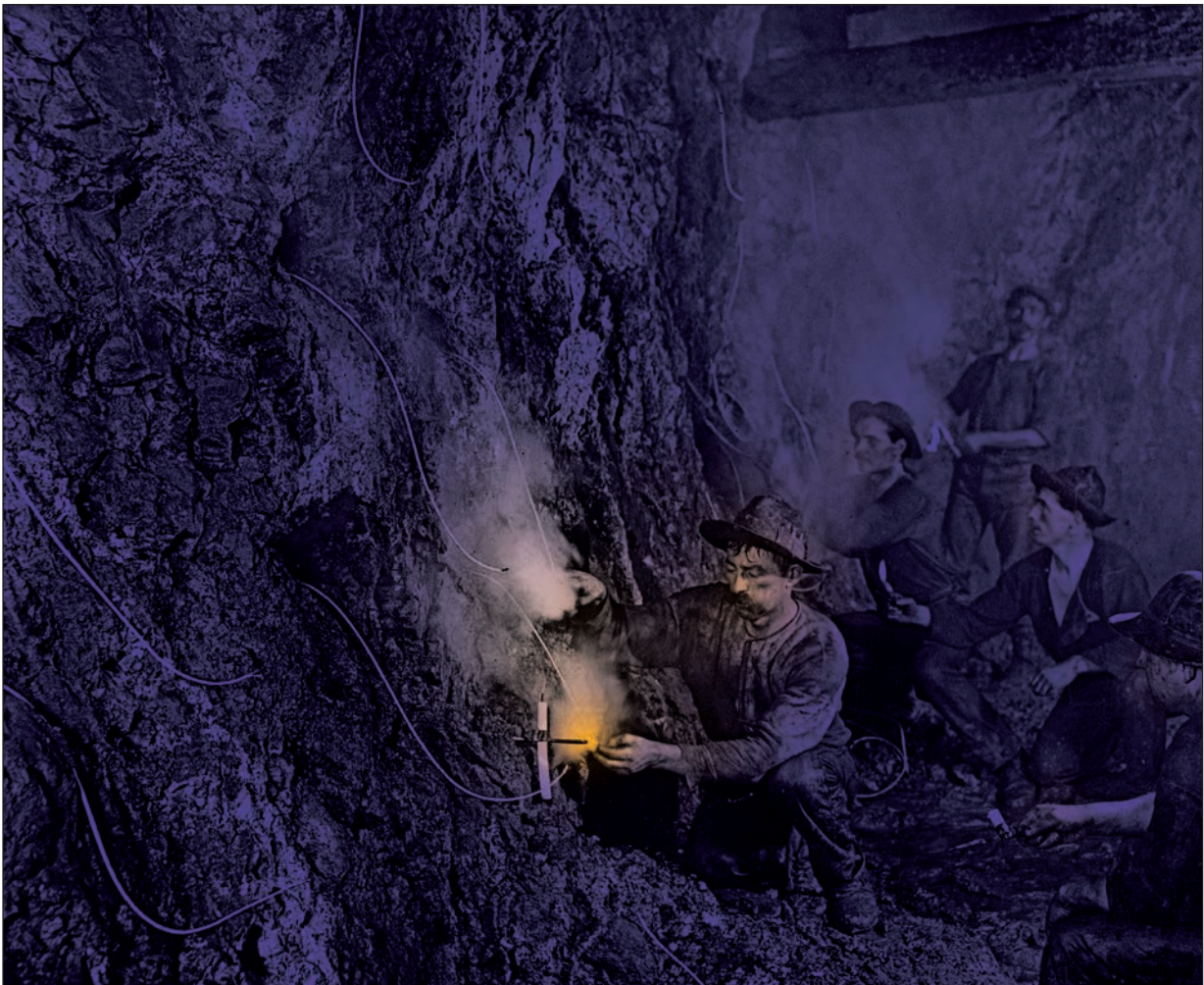
Underground mining was dirty, difficult, and dangerous work.

Gold wasn't Montana's only valuable metal. Montana was also rich in silver and copper. Copper is used for telegraph, telephone, and electrical wires. Demand for copper grew in the 1880s and 1890s as telephones became common and people began to use electricity to light their homes, schools, and businesses. Butte, Montana, had some of the richest copper mines in the world. Because of its mines, the city got the nickname the "Richest Hill on Earth."