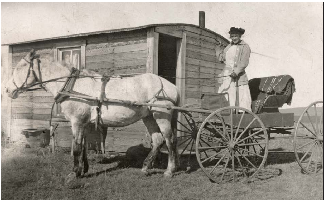
Many homesteaders lived in small “homestead shacks” until they had the time and money to build something bigger.

Push factors (things that make people want to leave their homes) played a role, too. War, poverty (being poor), and discrimination (treating a group of people unfairly) led many