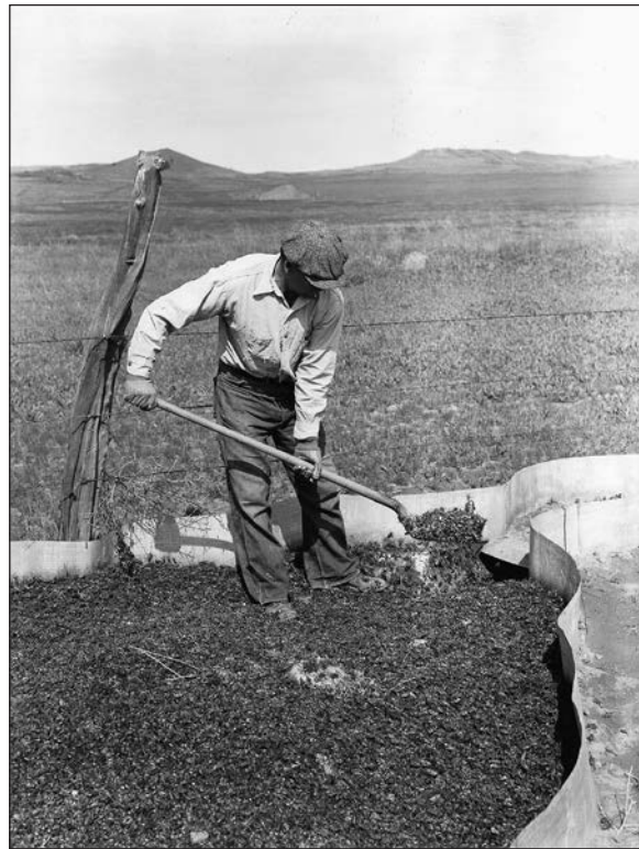
Hordes of crickets invaded eastern Montana between 1936 and 1941. Farmers defended their crops by building “cricket traps” like this one.

Insects ate everything green in sight. Topsoil blew off the fields, creating giant dust storms. By 1925, many of the immigrants (people who move to a new country) who had come to Montana to homestead had left the state.