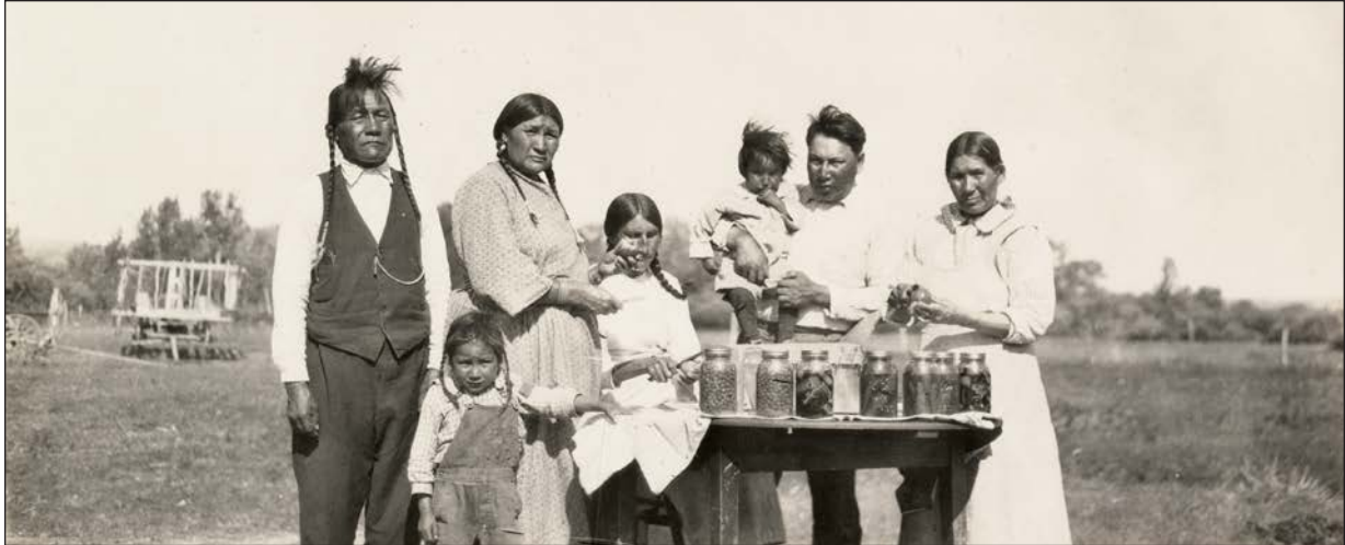
Indian agents encouraged tribal members to adopt non-Indian methods of survival, including growing and canning fruits and vegetables.

made it hard, Indians worked to keep their cultures alive. They continued to speak their own languages and practice many of their traditional (old) ways. They also continued to educate their children. Before Europeans came, Indian children did not go to school. Instead, their families taught them about the natural world (science) as well as about their history and how they should behave (social studies). They learned to make art. They also learned how to hunt, gather food and medicine, and make tools. They learned other skills they needed to help themselves and their families once they grew up, too.