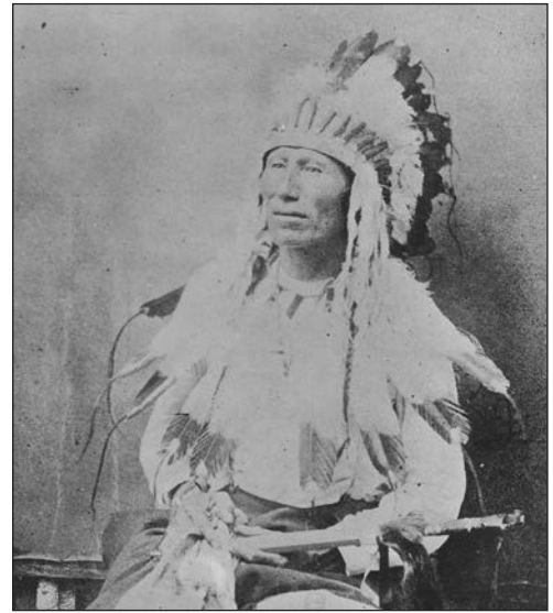
Chief Dull Knife

Dull Knife believed strongly in education. That is why Chief Dull Knife College on the Northern Cheyenne Reservation is named in his honor.