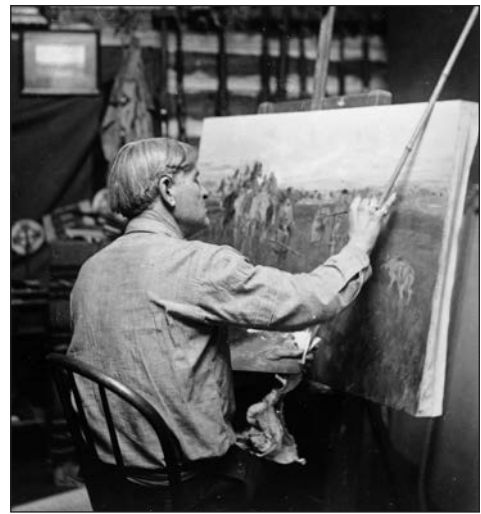
Charles M. Russell in his studio painting The Lewis and Clark Expedition, 1918.