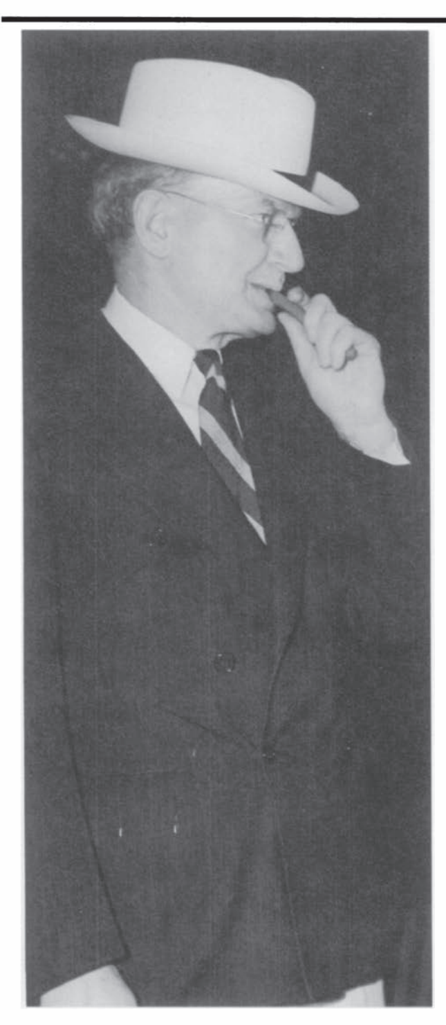
Wheeler became the chief Democratic critic of FDR's foreign policy on the eve of World War II. Fearful of executive power and true to his pacifistic beliefs, Wheeler opposed peacetime conscription, military preparedness and Lend-Lease aid to Britain in 1941. From the floor of the Democratic Convention in 1940, when FDR ran for an unprecedented third term, Wheeler fought for a peace plank in the party platform, and in the following months blasted the administration without end, warning that America was being thrust toward war.