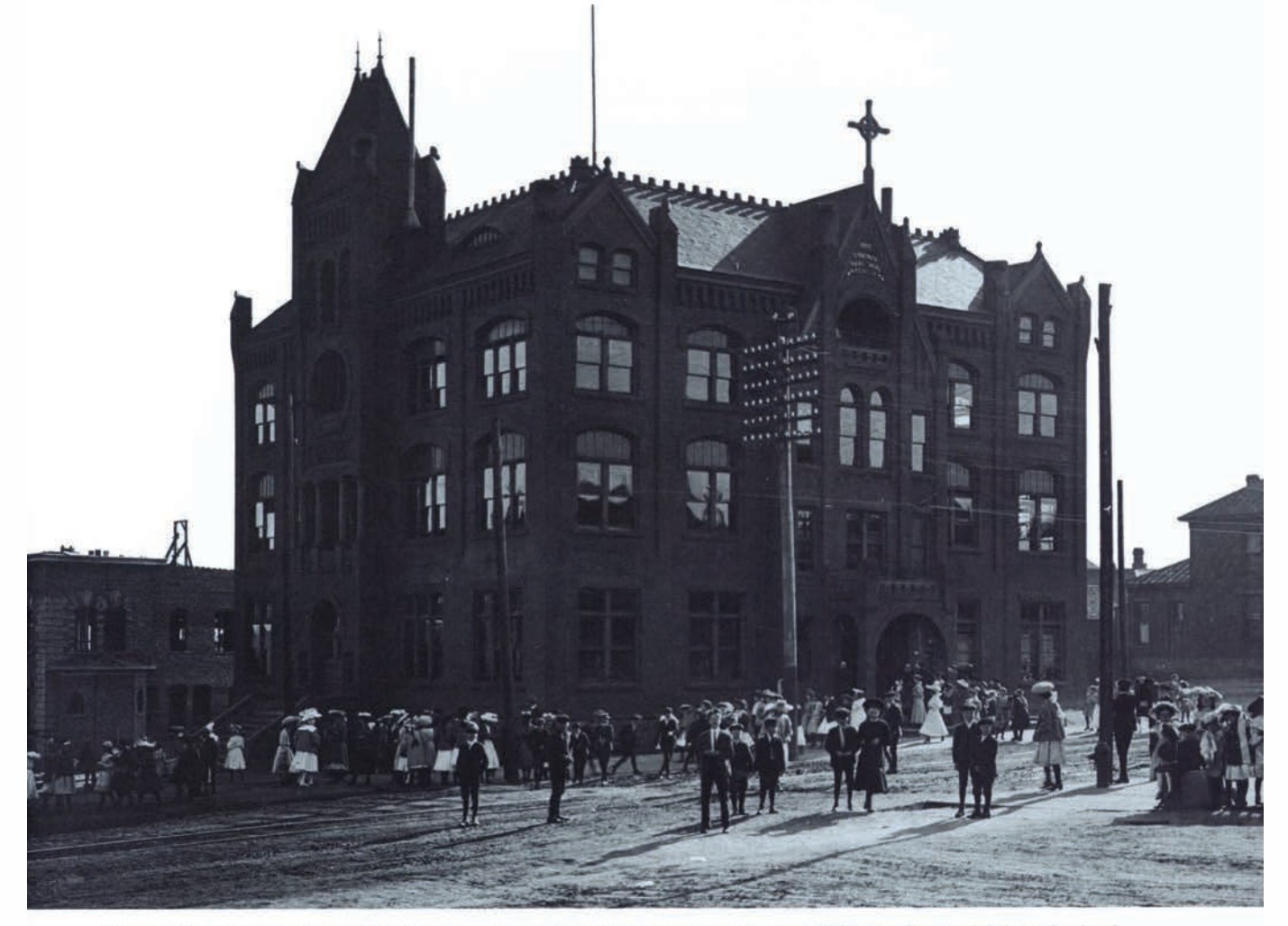
Catholic high school education had its start with St. Patrick's School, above, circa 1905, the first parish-based school to expand its curriculum beyond elementary school. St. Patrick's graduated its first high school class in 1896 and was replaced by the larger Central High School in 1908.

Butte's schools received direction from the State of Montana, a national leader in public education. For example, the Montana legislature passed a stringent compulsory education law in 1902 that included harsh consequences for truancy and called for the establishment of industrial schools for the detention of habitual truants in cities with populations of more than twenty-five thousand residents. The Butte Industrial School, with capacity for forty students, opened in November 1903 with the mission to