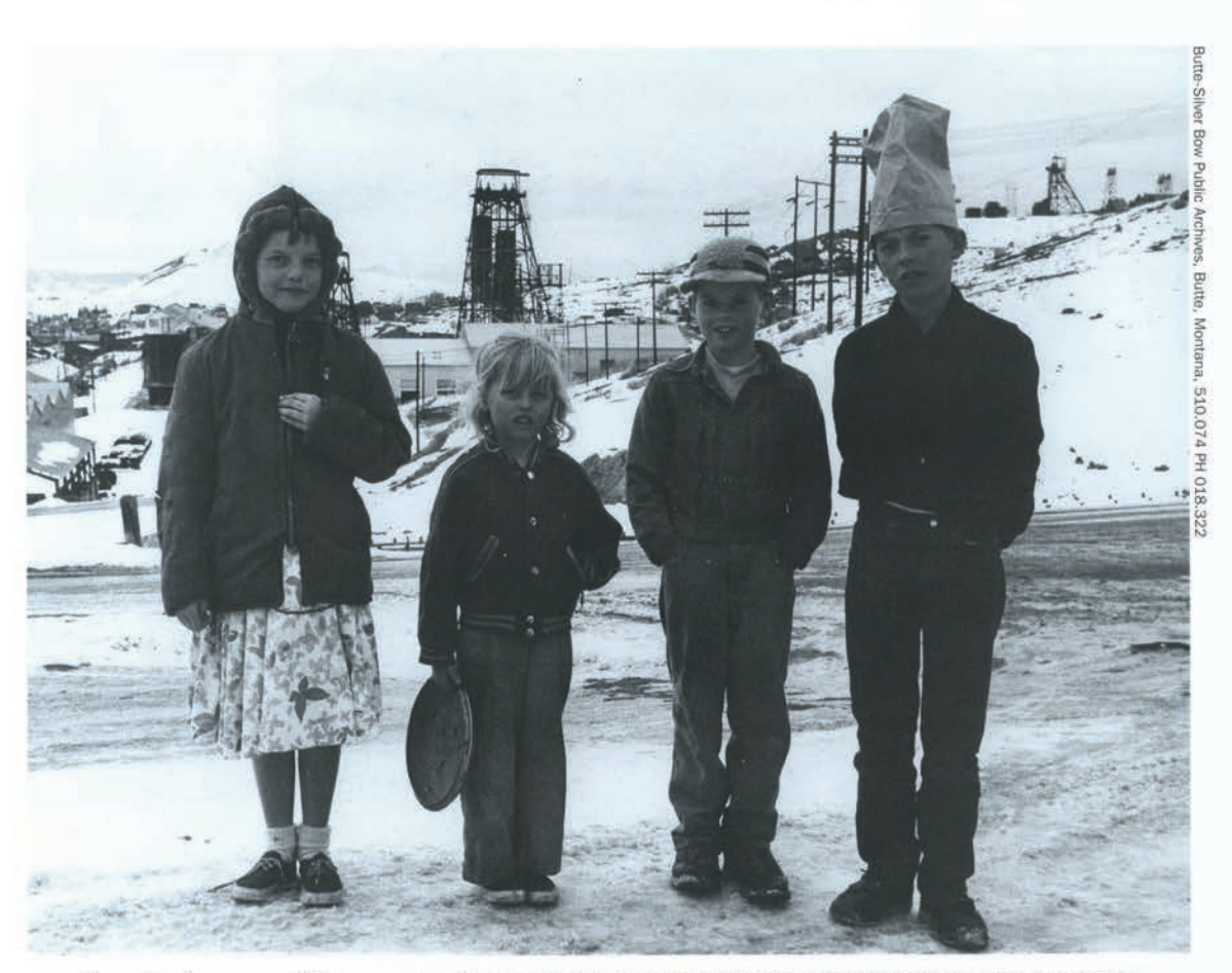
Through a focus on children, we come to appreciate how and why people called Butte home and engaged in the risky business of mining generation after generation. Above, unidentified children pose in the 1950s with the Kelley Mine gallows behind them.

called Butte home and engaged in the risky business of mining generation after generation. When children are taken into account, the social history of Butte gains new meanings. Community life not only was modulated by shift work in the mines and the possibility of strikes but also moved to the pace of school days and, in summer, to the weekly rush of Children's Day at Columbia Gardens. Miners changing shifts competed with children for space on the Hill. A miner's daily connection to the world beyond Butte came through an exchange on the street with a youngster hawking newspapers. Parents, teachers, neighbors, and a host of civic groups dedicated themselves to the herculean task of child rearing. In a multitude of ways, children were a powerful force to be reckoned with, and Butte families lived with the hardships and dangers of mining life so that their children might have a life beyond mining. Children were, quite simply, Butte's