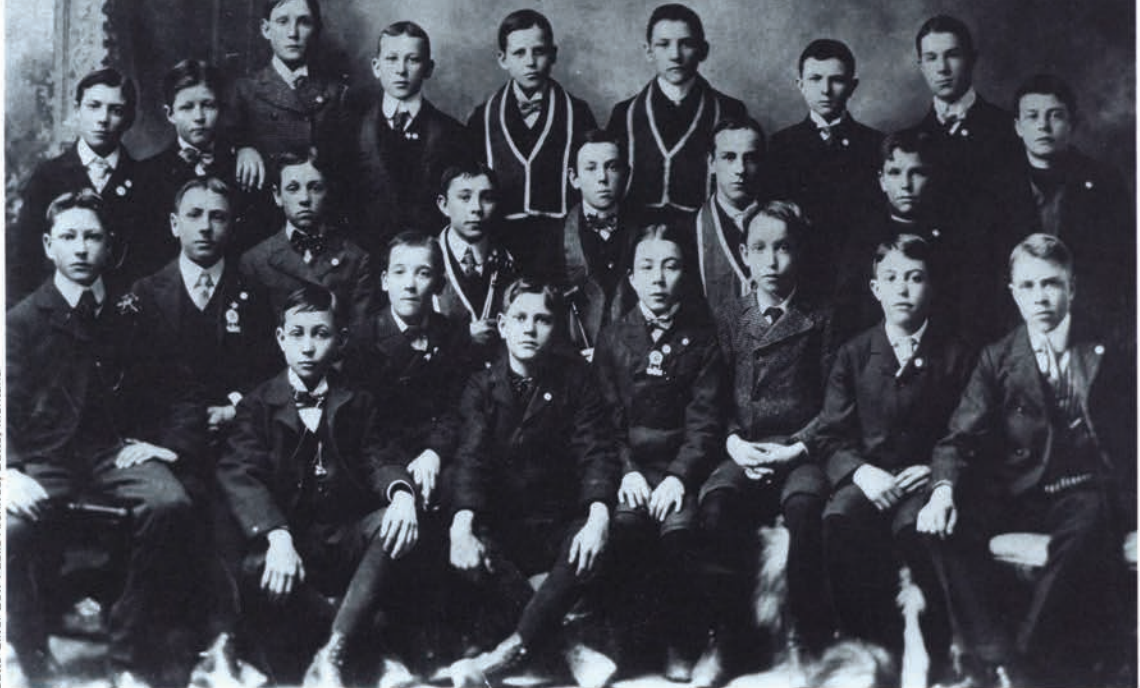
To provide organized recreation and supervision of the newsboys who "roamed the streets" of Butte at all hours, business leaders and Women's Christian Temperance Union activists organized the Butte Newsboys Club in 1903. Club members (above, circa 1905) wear lapel pins issued by the club. The club remained active until 1931, when it was judged to have outlived its usefulness.

In order to survive on Butte's tough terrain, residents not only worked hard but played hard. Young and old alike found escape from the rigors of mining life in dance halls, theaters, ball fields, and skating rinks. From its early days, Butte was a die-hard sports town. Butte children grew up in a world as dominated by the rivalries of high school and Independent League football, the brash blows of boxing, and the joys of sandlot and league baseball as by mining. Professional boxing was a Butte favorite, and children as well as adults rallied around local heroes as they came up