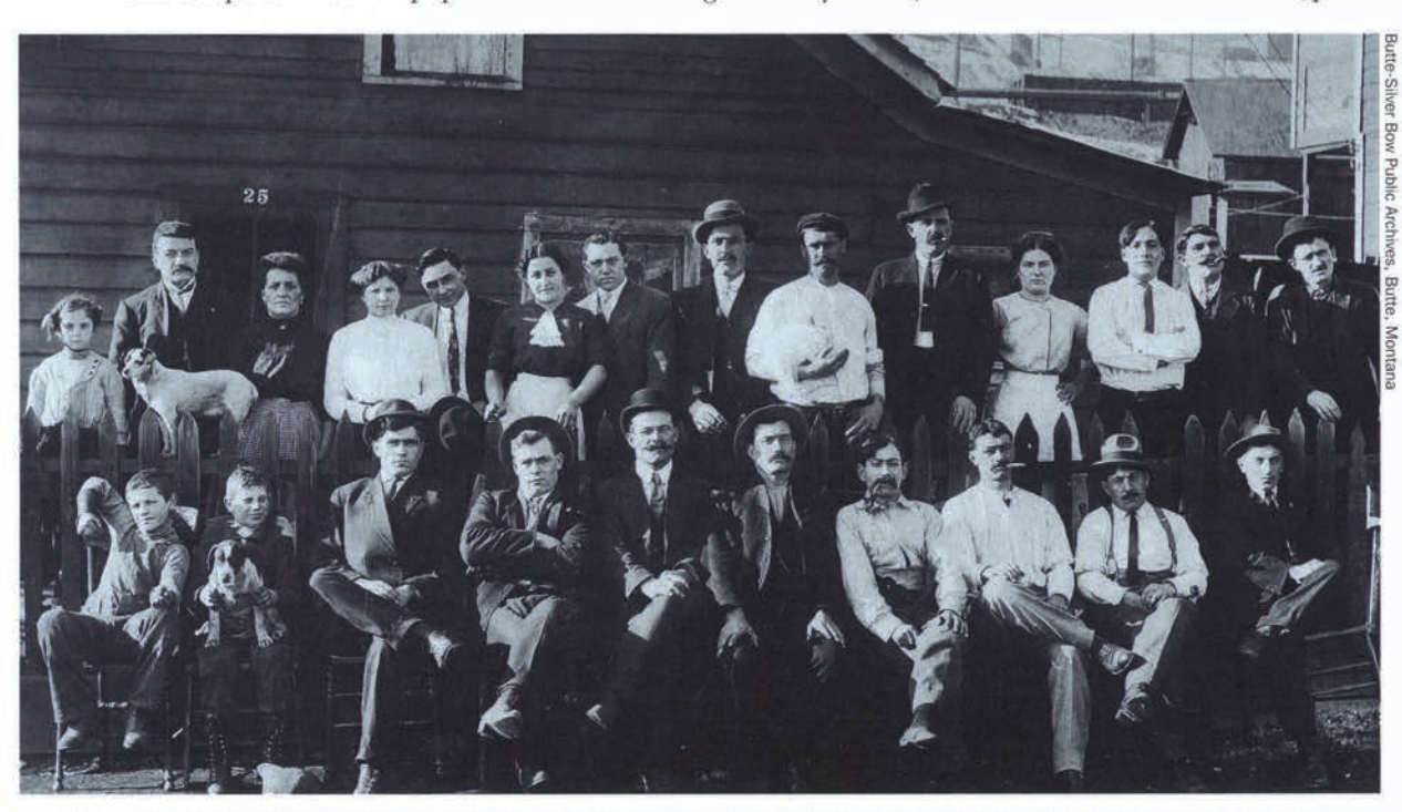
It was a truism in Butte that miners were lucky to live past forty, and widows often ran boardinghouses, such as this one in a railroad section house, as a means to support their families. Residents pictured here circa 1900 include children and pets as well as the boarders and the women who ran the enterprise.

Mining was notoriously dangerous work. Injuries wrought by a "fall of ground," premature explosion of dynamite, and illnesses such as tuberculosis, pneu-