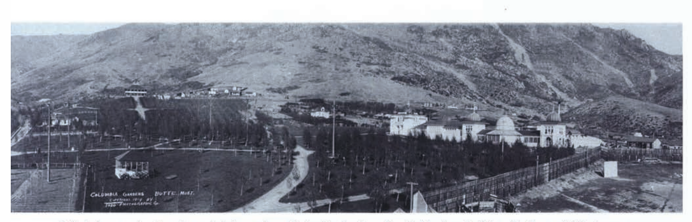
Butte's true centerpiece for entertainment was Columbia Gardens, located just east of the city. Every child's dream, it included acres of lawn, forested picnic grounds, a lake, a zoo, a playground, pavilions, a penny arcade, a roller coaster, and a ball field. This panorama of Columbia Gardens is dated 1914.

I could see in the Catholic Cemetery three or four funerals in there at one time. It was really a terrible, terrible situation."<sup>37</sup>