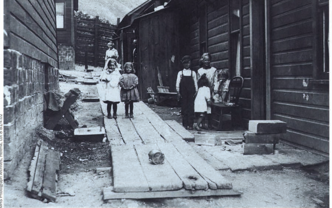
The challenges of child rearing at the turn of the century were daunting. Overall, children were often poorly housed, clothed, and fed. The children above were pictured in the backyards of houses on the 1100 block of East Broadway for a 1908–1912 report on the working and living conditions of Silver Bow County miners and their families.

The Montana legislature approved a mother's pension program in 1915, which provided aid to widows or mothers whose husbands could not support their families. Aid was limited to children fourteen and under, and it provided a maximum allowance of ten dollars a month for the first child with decreasing amounts for additional children.<sup>9</sup>