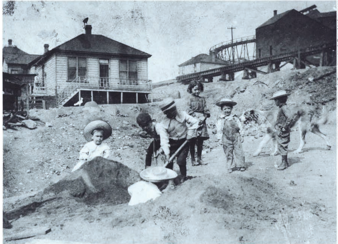
Children in Butte created their own games and picked their own places to play. In a community devoid of grass and trees, an ore dump might serve as playground. The waste piles were excellent places for sledding and such other activities as digging a mine, the pursuit of the "young prospectors" in this circa 1909 image.

Frank Carden spent many a Saturday at the Lyric Theater on Butte's East Side: