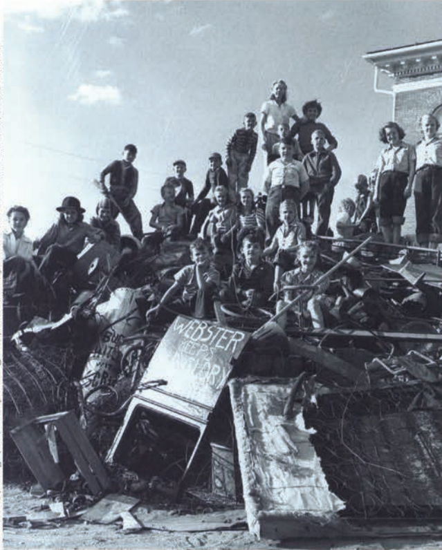
During World War II, children of all ages were expected to contribute to the national defense. Butte kids helped search neighborhood yards, alleys, and empty lots, looking for scrap iron, steel, copper, and rubber. Here, a group of "scrap detectives pose with their finds in October 1942.

development projects, including seven parks with playing fields, baseball diamonds, and tennis courts.62