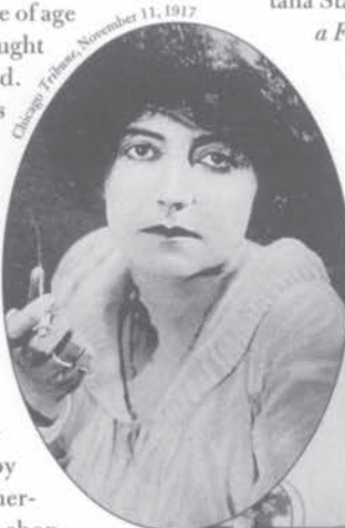
Chicago Tribune, November 11, 1917