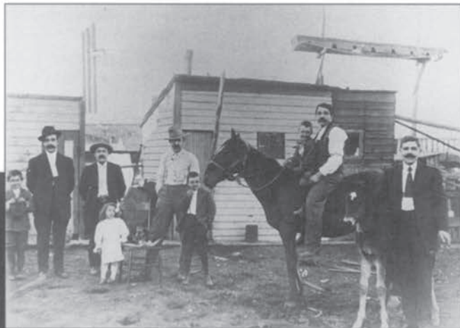
Red Lodge's immigrant communities learned to temper their "foreignness" by engaging in rituals of patriotism such as buying war bonds and participating in Liberty Loan drives and war rallies. At left, the Finnish ladies' band poses in 1907, and above, residents of Little Italy gather in their neighborhood on the northern fringe of Red Lodge.