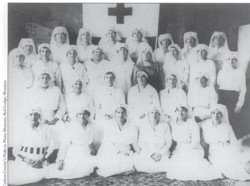
Carbon County's Peaks to Plains Museum, Red Lodge, Montana

Fear compelled Red Lodge's ethnic groups to publicly voice their allegiance to the United States and participate in activities to reinforce and prove their loyalty, but they tended to do so within their own ethnic communities. One such group was the Finnish auxiliary of the Carbon County Red Cross pictured at left.