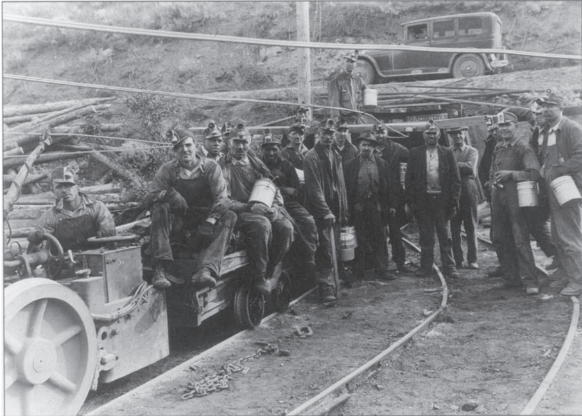
Frank's Studio, Red Lodge, Montana

Inspired by John Lewis's leadership and infuriated by local managers, Red Lodge workers sometimes went beyond national union strike plans, holding out longer than their counterparts in other areas of the country. Above are typical Red Lodge coal miners.