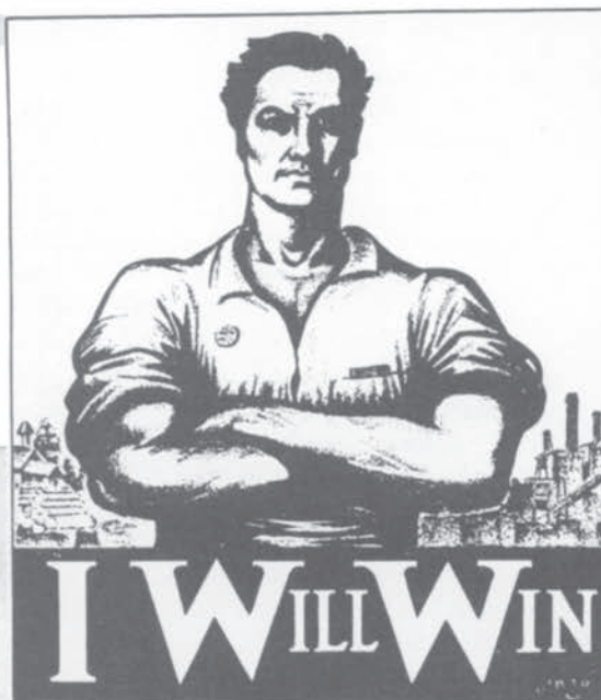
From Solidarity , August 4, 1917. MHS Photograph Archives, Helena

public Americanism appeared fairly benign. By the end of 1917, though, the actions of the Liberty Committee would change all that.