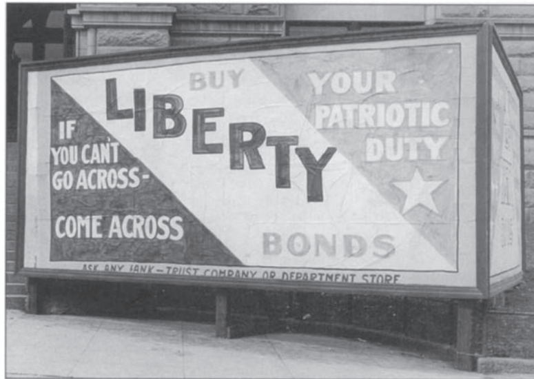
Detail, MHS Photograph Archives, Helena

World War I propaganda revolved around the concept of “100% Americanism,” and ostentatiously buying war bonds was an important component of being a patriot, as were speaking positively about the war, working for the Red Cross, and laboring diligently to provide the nation with essential products. As participants in these activities, Red Lodge’s immigrants were less targeted by zealots than were labor radicals and those who openly criticized the war.