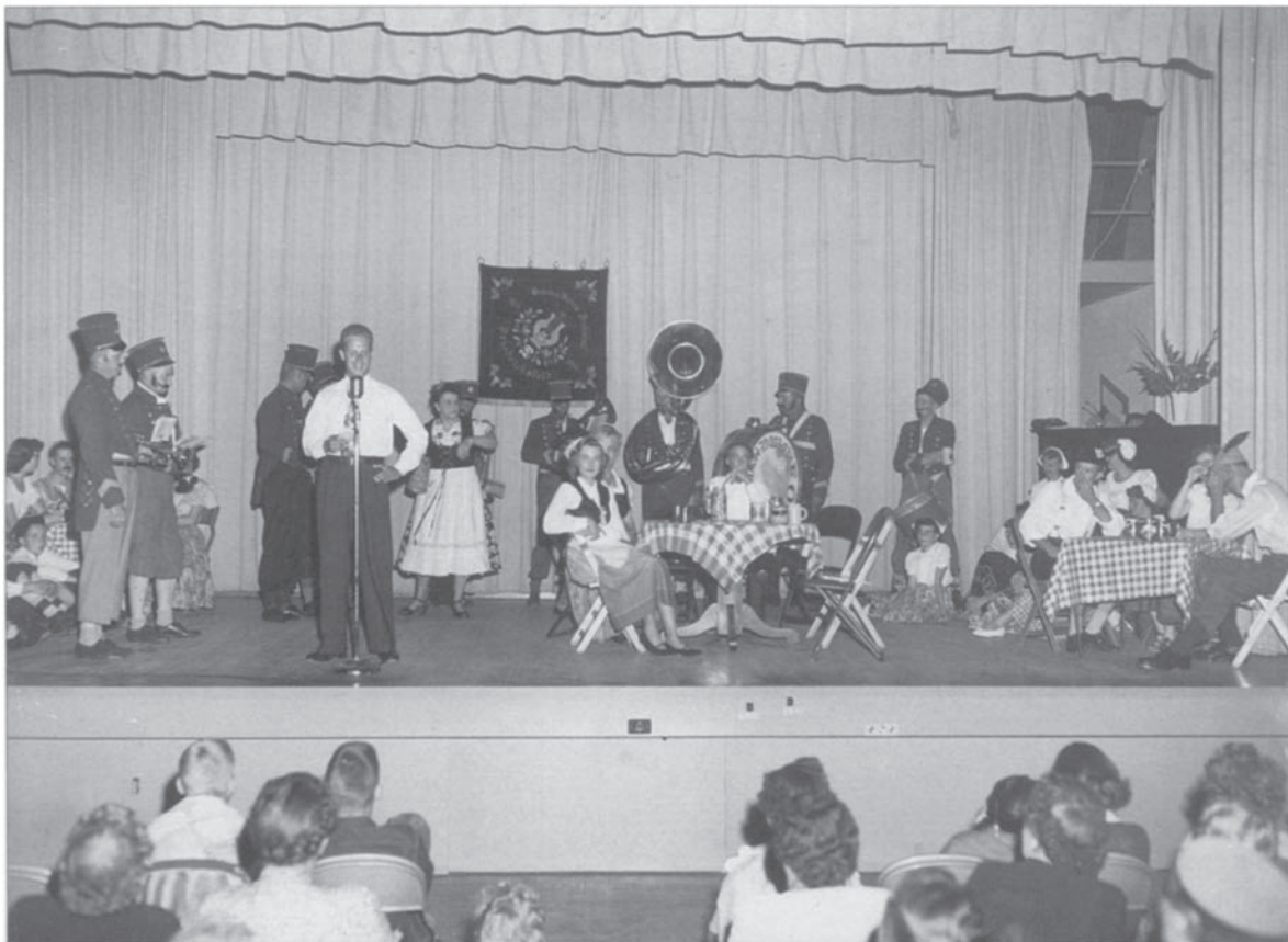
Flash's Studio, Red Lodge, Montana

World War I and Liberty Committee actions jolted members of Red Lodge ethnic groups into acknowledging an American identity and initiating steps toward greater community cooperation. Several multicultural festivals were held in the 1930s, and the Festival of Nations began in 1951. Below is a scene from the German-night program that featured traditional songs and dances.