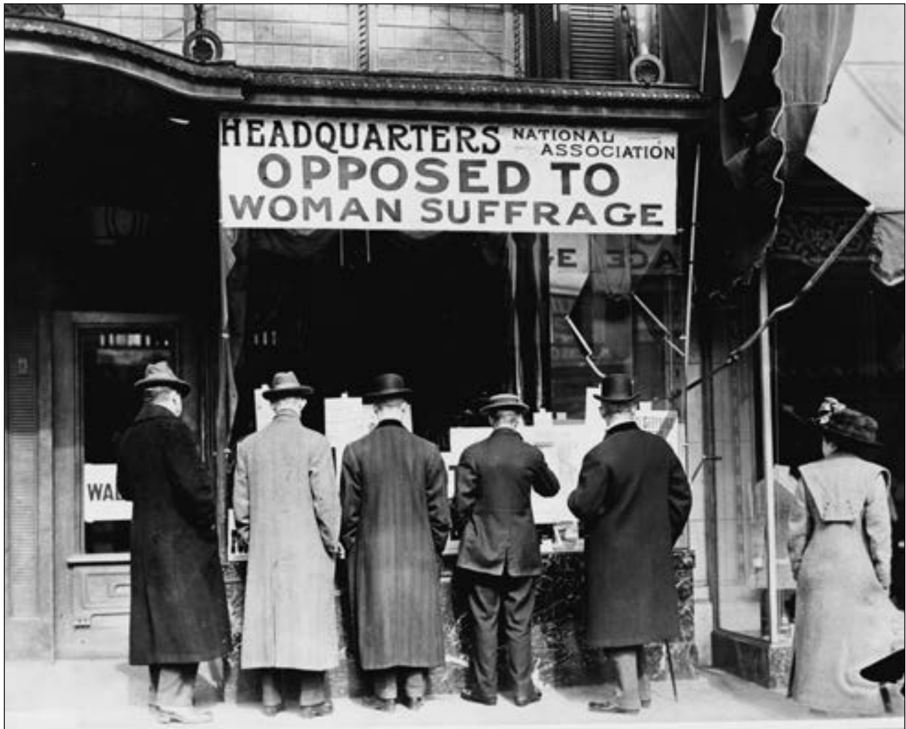
Exhibit 2-D “National Anti-Suffrage Association,” c. 1911, Harris and Ewing, photographer. Harris & Ewing Collection, Library of Congress Prints and Photographs Division, Washington, D.C. LC-USZ62-25338