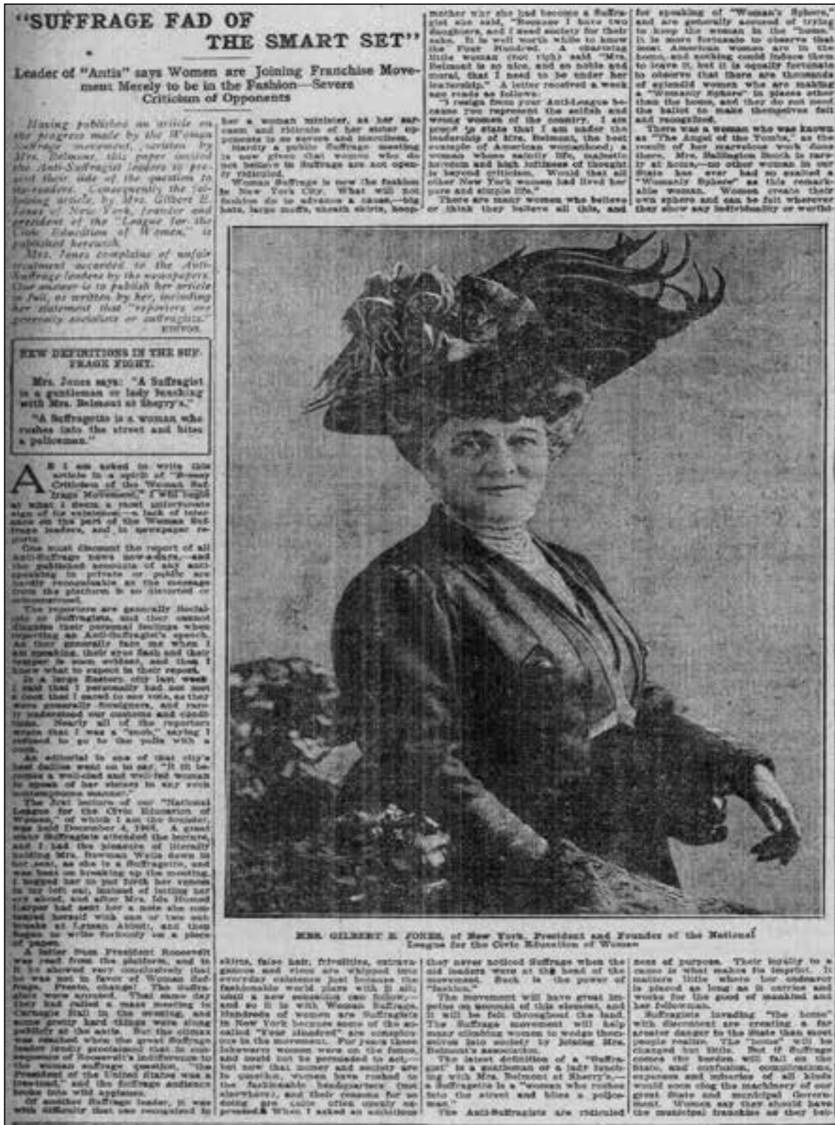
Exhibit 2-A Newspaper article: "Why We Don't Want to Vote," Woman's Home Page, Bridgeport Evening Farmer, April 30, 1910. Full page available at http://chroniclingamerica.loc.gov/lccn/sn84022472/1910-04-30/ed-1/seq-8.pdf . See the following pages for a transcript.