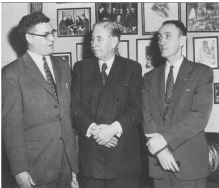
Congressman Lee Metcalf, Senator James E. Murray, and Senator Mike Mansfield (left to right), Montana's three "M's," in Washington, D.C., in 1956