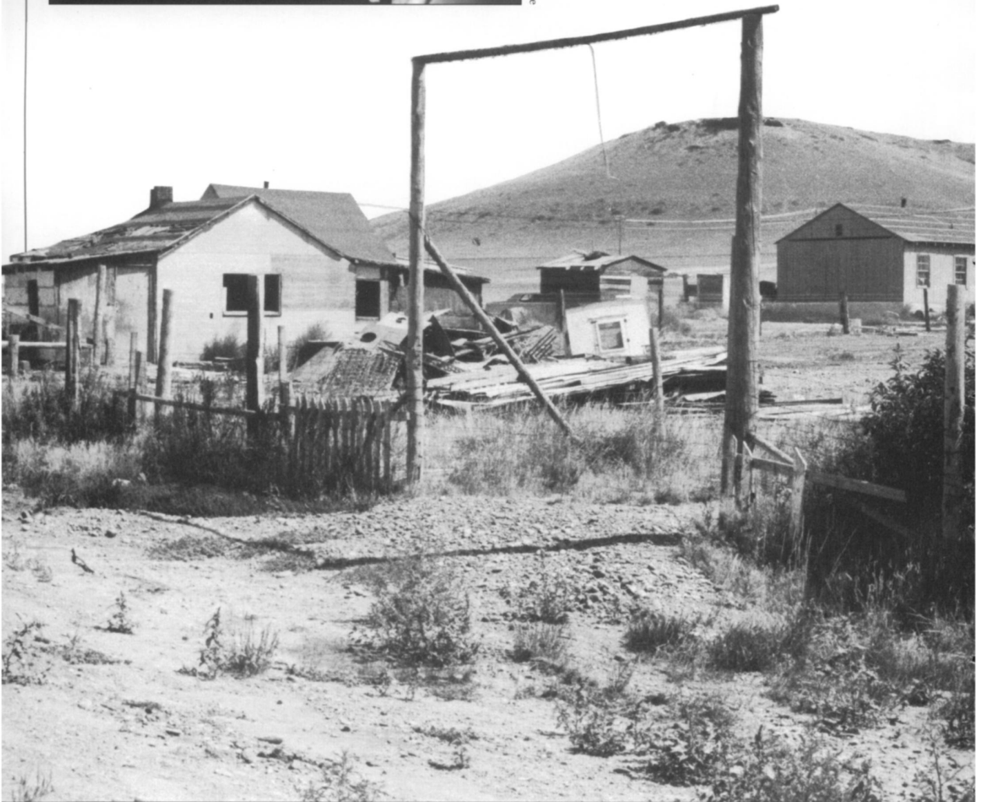
Great Falls Tribune