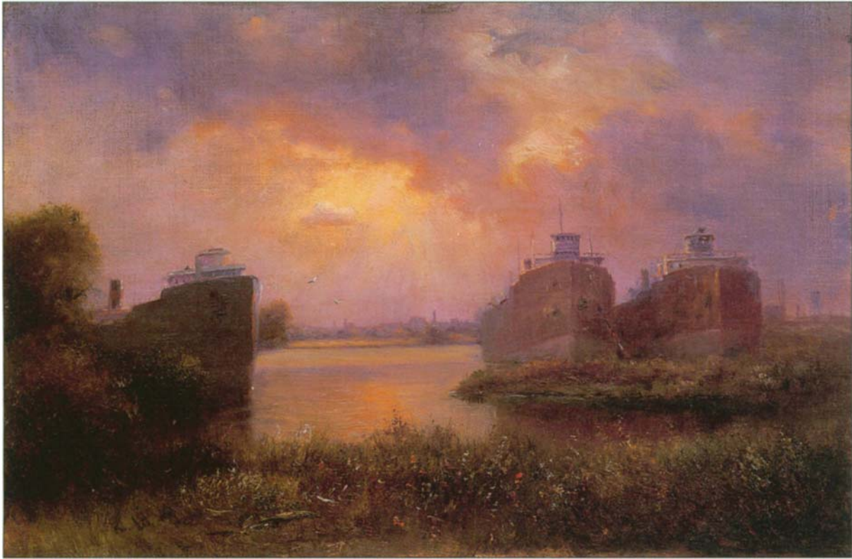
Little of DeCamp's early work has survived. Nonetheless, DeCamp was fascinated with engineering and the mechanical arts all his life and painted the above scene, The Derelicts (circa 1935, oil on board, 8" x 12"), while living in Chicago in the 1930s. The image is based on a scene of abandoned ships at Lake Calumet.

he produced a similar type of illustration for a very different purpose that ultimately and dramatically changed his life. After witnessing a train accident, DeCamp drew sketches of the mishap that were used as evidence in a resulting court hearing. His drawings attracted the attention of Charles Fee, a high-ranking executive for the Northern Pacific Railroad. Fee, a tireless and expert promoter, regularly commissioned artists to travel west to paint the scenic wonders and dramatic landscapes encountered along the railroad's recently completed transcontinental line. The art produced on these expeditions was used to adorn station lobbies and other public spaces, and in promotional materials designed to lure potential passengers westward. Impressed with DeCamp's ability, Fee asked the painter to join this corps of artists working on the Northern Pacific's behalf, and the young artist accepted.