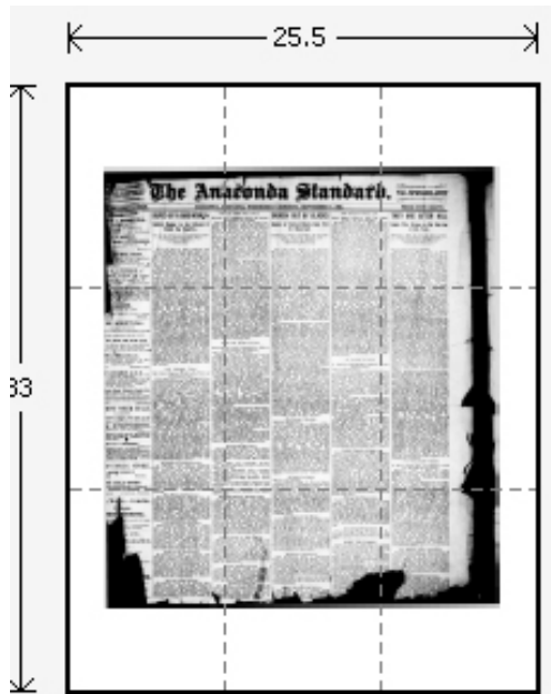
Figure 2 Newspaper page shown divided into nine sections.

It will print across nine sheets of 8½ x 11 paper.