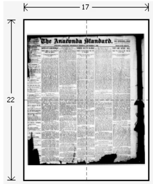
It will print across four sheets of 8½ x 11 paper.

If you do not see the page divided into four sections, as shown above, you can rescale it. In the Tile Scale box, replace the 100 with a lower percentage, for example, 90.